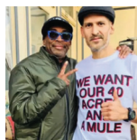
Spike Lee at First Village Coffee

BlackKlansman We are thrilled to announce a Friday night screening of BlackKlansman , Spike Lee's acclaimed and thought-provoking film, which happened to film several scenes in Ossining. Featuring a star-making turn by John David Washington and excellent performances by Adam Driver and Topher Grace, the film is the remarkable true story of Ron Stallworth, the first African-American detective in Colorado Springs who sets out to infiltrate the Ku Klux Klan. The film, Rated R, runs 2 hours and 15 minutes. Doors open at 6:45 p.m.